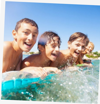
Creating lifelong friendships