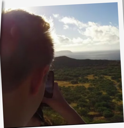
Expand your horizons